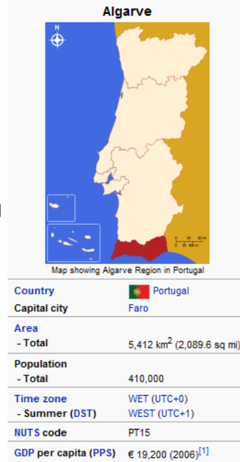
Fig. 1. Mediawiki infobox syntax for Algarve (left) and rendered infobox (right)

to obtain suitable value representations. For instance, internal MediaWiki links are converted to DBpedia URI references, lists are detected and represented accordingly, units are detected and converted to standard datatypes etc. Nested templates can also be handled, i.e. the object of an extracted triple can point to another complex structure extracted from a template.